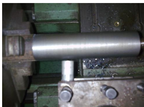
Figure 3: Equipment used for friction surfacing.

The substrate is rotated with preferable speed and the mechatrode is made to contact with that rotating substrate. Here the substrate and mechatrode are in perpendicular planes as shown in Fig 2.