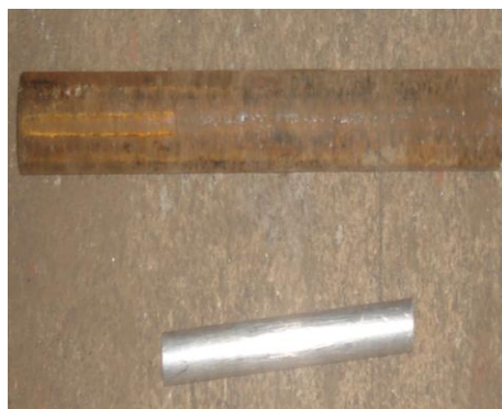
Fig 2: Machining of raw material

Substrate was prepared from 40 mm diameter bright mild steel bar. It was turned to get a diameter of 35 mm and to have perfect turning/truing. The surface roughness obtained is approximately 0.7 \mu m and 1.5 \mu m on the surface of mechatrode and substrate respectively. Consumables and substrates are shown in fig 2, were cleaned with ethanol perfectly before use.