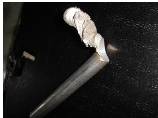
Fig 5: Shows the deformation of the Aluminum mechatrode in friction surfacing process.