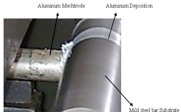
Figure 4: Deposition of mechatrode material on to the substrate material by rotary friction.

The mechatrode material is been deposited on the substrate material.